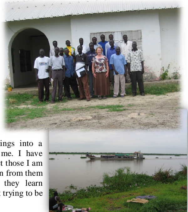
The Nile Motorway

forgiveness possible at such a level – what does it look like, what should it feel like? Often when we talk about forgiveness in the West, we talk about hurtful words or other minor things – the experiences of my students have put things into a new perspective for me. I have come to deeply respect those I am teaching here and learn from them probably more than they learn from me (and I am not trying to be humble here).